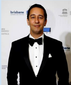
Composer: Omar Fadel